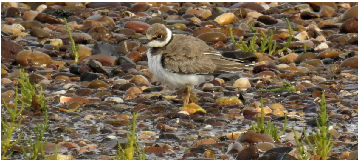
9 Aug