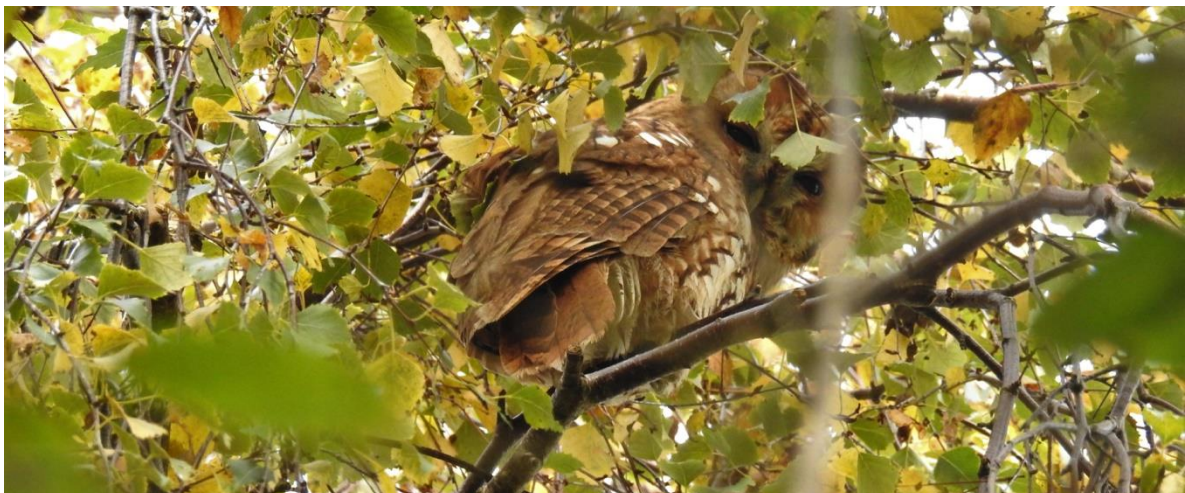
11 Nov

2021 summary. Seen, or more often heard, during the year in Jan, Feb, May, Jul, Sep-Dec. A pr calling to each other on several dates in Nov was the first multiple record.