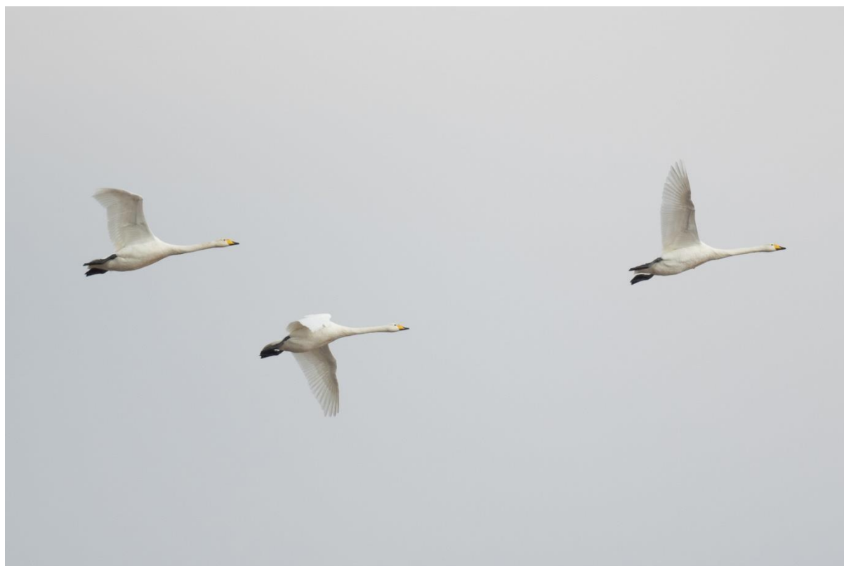
6 Mar

2021 record. Three ads flew out to sea on 6 Mar before returning and undertaking a tour of the estuary. The 14 th site record.