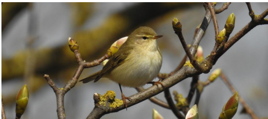
18 Apr

Autumn. First returning birds two on 10 Jul, max nine on 15 Sep. Last one on 20 Sep.