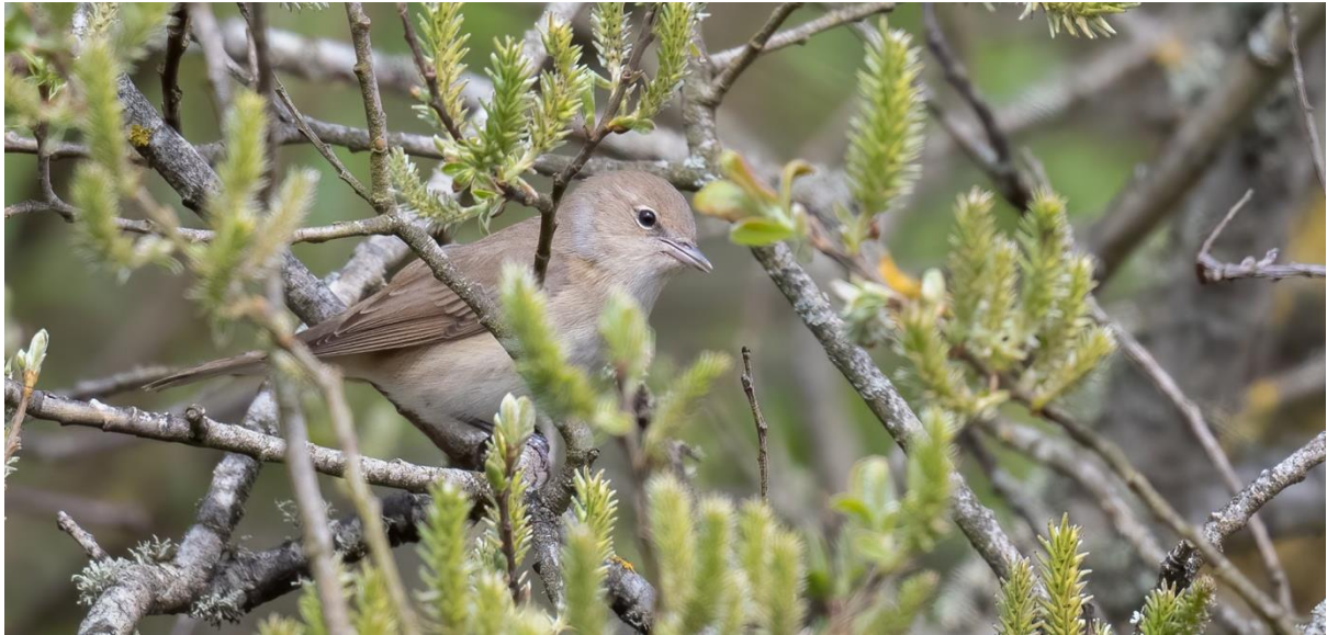
2 May

Status. Very rare autumn migrant, seven previous records