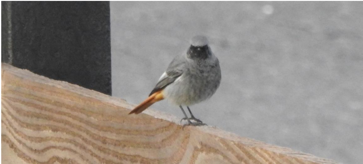
16 Dec

2021 records. A fem/imm briefly on the seawall on 5 Nov with a virtual repeat performance from a male on 16 Dec.