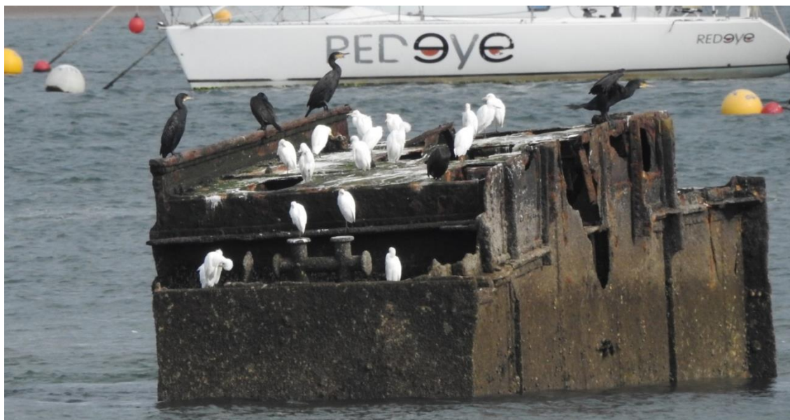
13 Oct © Alan Keatley