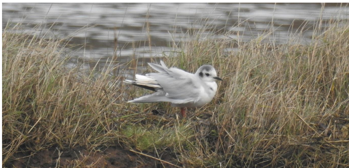
16 Feb

2021 records. In the first winter period an adult off Warren Point on 14 Feb and in the saltmarsh on 16 th . In autumn a 2 nd winter was present between 7-11 Sep with a 1 st winter on 13 Oct.