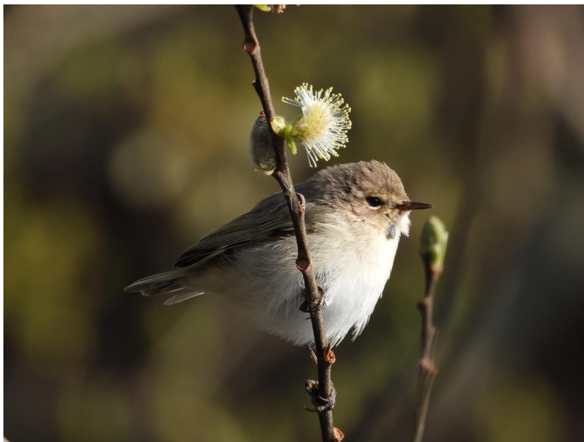
19 Apr

2021 records. An elusive bird remained from 2020 until at least 6 Mar with one on 10 & 19 Apr. In November one on 6 th and a noticeable influx in December, with a record five present on 5 th and at least one remaining into 2022.