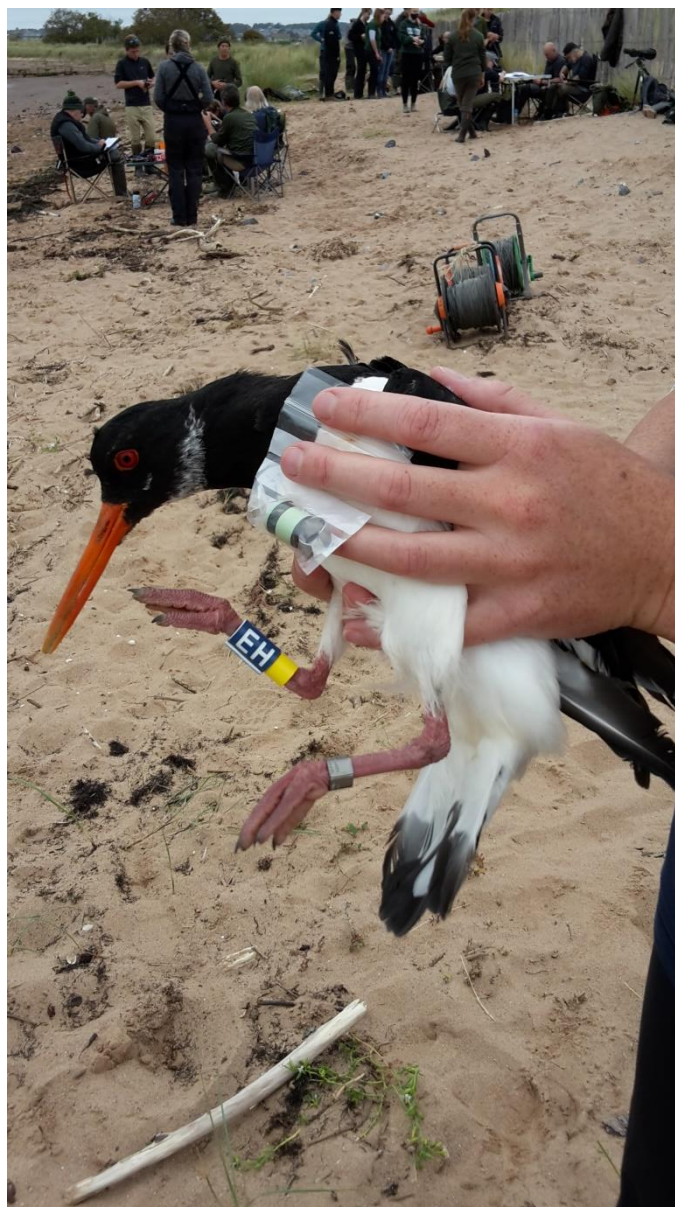
Oystercatcher 8 Oct