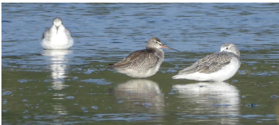
With Greenshank 11 Sep

2021 records. One on 27 Jan south of Cockwood Harbour on the dropping tide, was the first Warren record since Nov 2014. In autumn a juvenile was present in the estuary on 5 -19 Sep before moving to Mudbank Lane, Exmouth. It returned briefly on 3 & 12 Oct and 3 Nov.