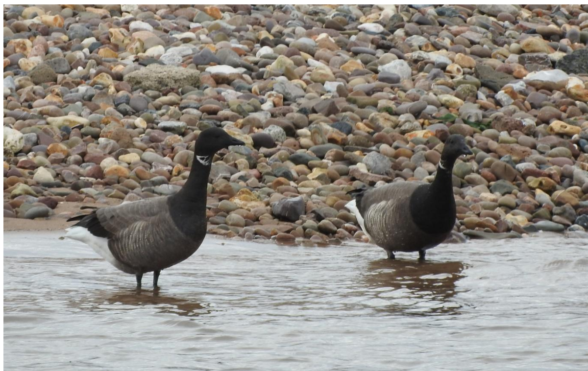
9 May

Status. Annual spring & autumn migrant, fewer in winter