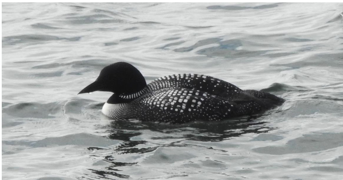
10 Jun © Alan Keatley