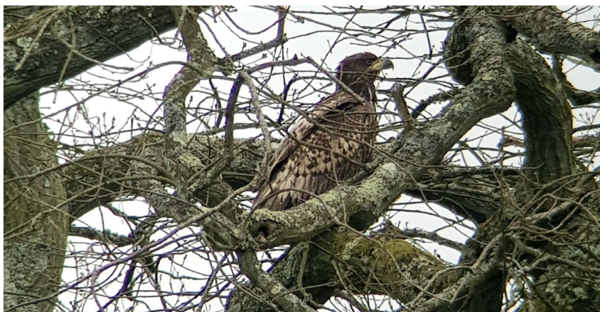
Cofton 21 Mar

It had flown along the East Devon coast the previous day, being seen on the Pebblebed heaths before roosting in the woodland to the east of Woodbury. After leaving Cofton she travelled a total of 75km that day passing over the Teign Estuary before roosting to the east of Plymouth.