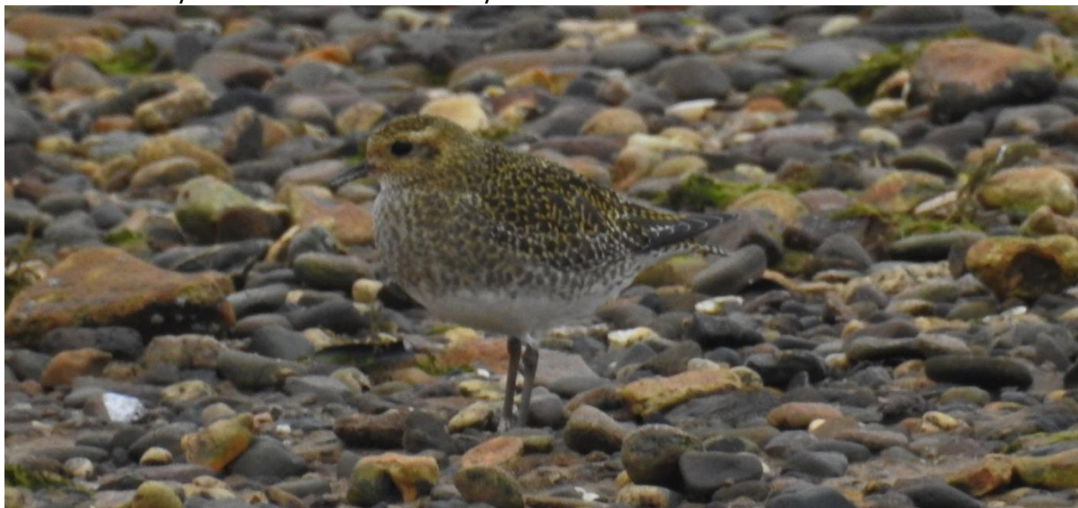
18 Dec

2021 records. Singles in the estuary on 6 & 30-31 Jan and 4 Mar. In autumn singles on 3 & 13 Oct with four over on 26 th . Further flyovers in Nov with singles on 2 nd & 5 th with two on 4 th . The last of the year was one in the estuary on 15 Dec.