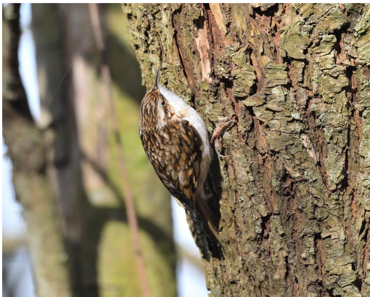
8 Feb

2021 records. One around the Entrance Bushes 8 Feb-10 Mar, singing on occasion. One in Dead Dolphin Wood on 4 Jul was a typical post-breeding movement.