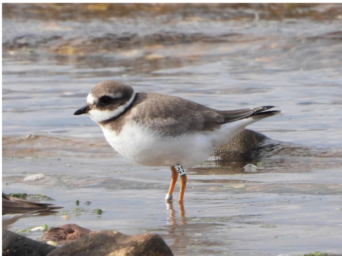
'3C' 7 Aug