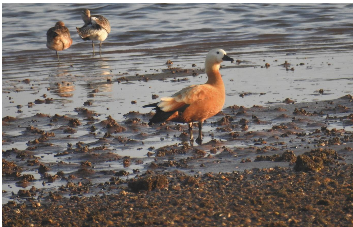
29 Apr

2021 record. On 4 Apr one was picked up heading S with two Shelduck, before circling back round into the estuary. It was relocated in Shutterton Creek before flying N up the estuary an hour later. It was later relocated on Exminster Marshes where it remained for several weeks with a brief return visit on 29 Apr. The British Ornithologist's Union is currently reviewing records of this species; depending on the outcome of this review this could be the second or third acceptable record for the Warren following one in Jul 1995 and five in off the sea on 7 Oct 2003.