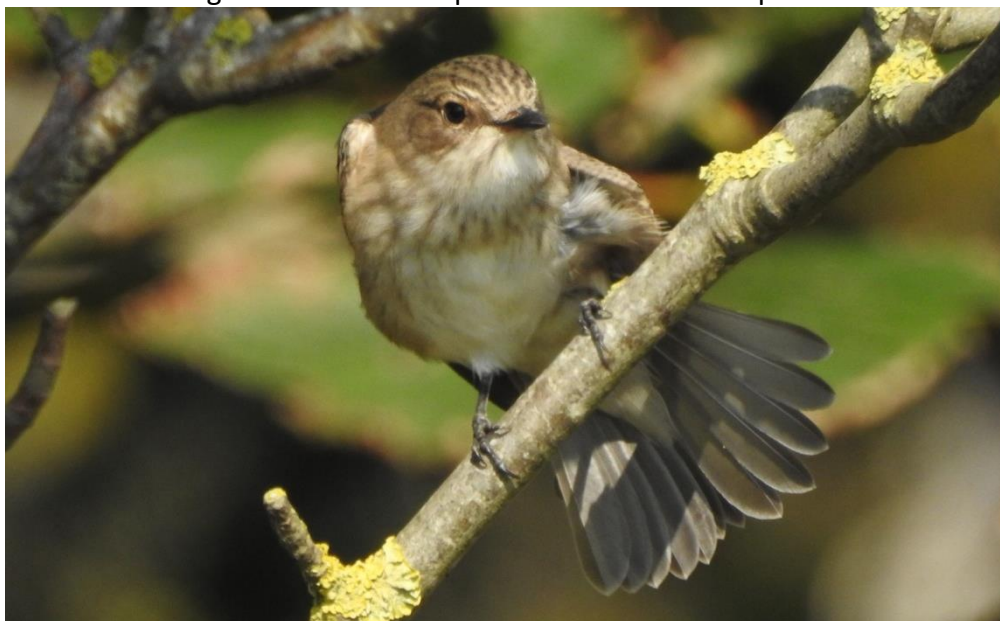
15 Sep

Autumn. One on 26 Aug and two on 15 Sep with the last on 19 Sep.