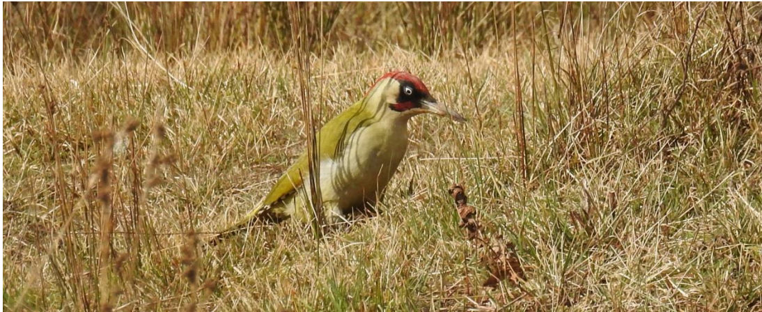
13 May

Status. Uncommon non-breeding resident and autumn migrant