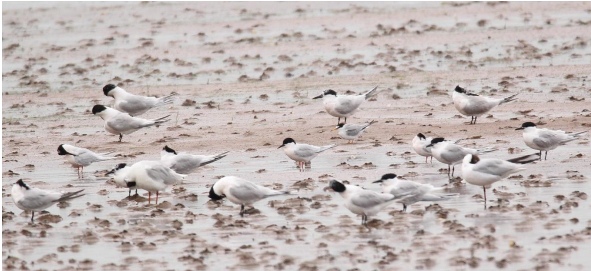
4 Jul - Little Tern and three Roseate Tern amongst Sandwich Tern

Status. Rare in spring, uncommon in late summer