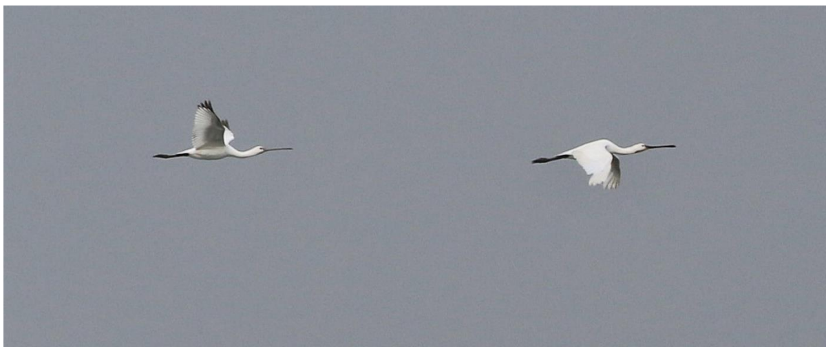
10 Sep

2021 records. In spring an immature S on 14 May, with another S offshore on 20 th , briefly checked out by two Pomarine Skua. In autumn, an ad on 5 Sep, two (same ad & juv) on 10 Sep and five (ad and four imm (1st & 2nd yrs) on 21-22 Sep. Finally a juv roosted on Finger Point on 4-6, 9, 22-24 & 29-31 Dec.