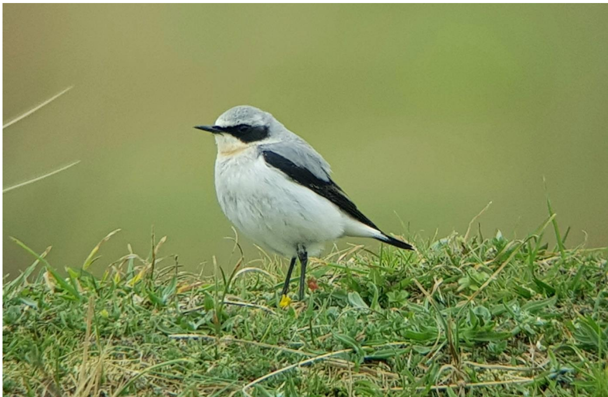
21 Mar © Lee Collins

Status. Scarce spring & autumn migrant, under-recorded