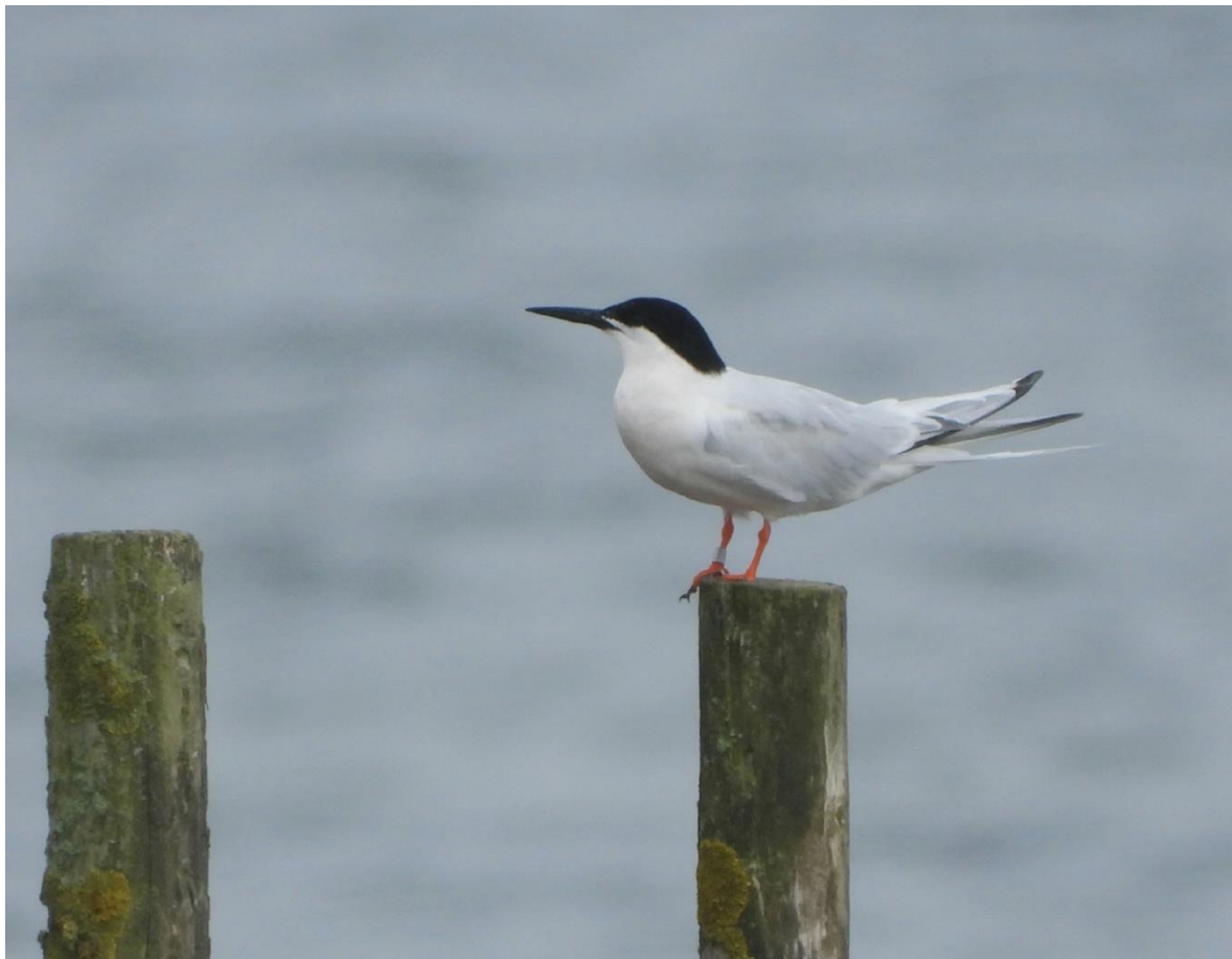
11 Jul

Ringling recoveries. Two new Irish ringed birds, both from Rockabill in Dublin Bay, both were 2 nd summer, a feature of many Warren records.