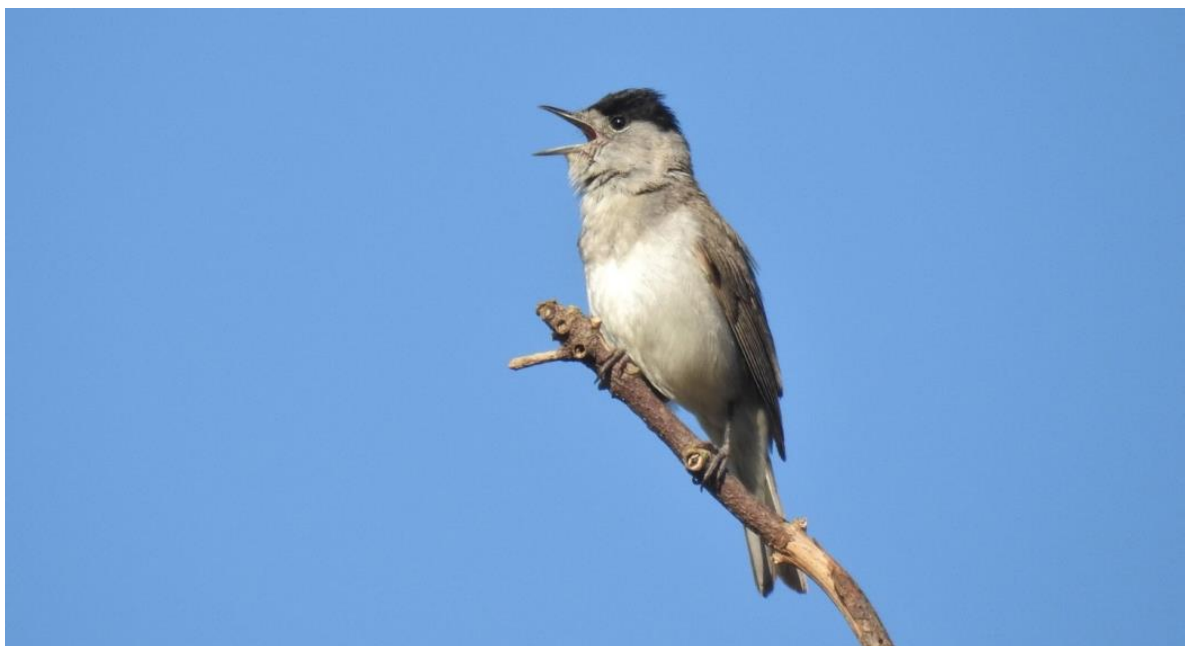
19 Apr

Autumn. Max 13 on 12 Sep but no other counts over five until end of Sep. In Oct regular until 24 th , with max eight on 3 rd & five on 17 th . Later records were all singles, on 30 Oct, 2 nd , 4 th , 8 th and 14 Nov.