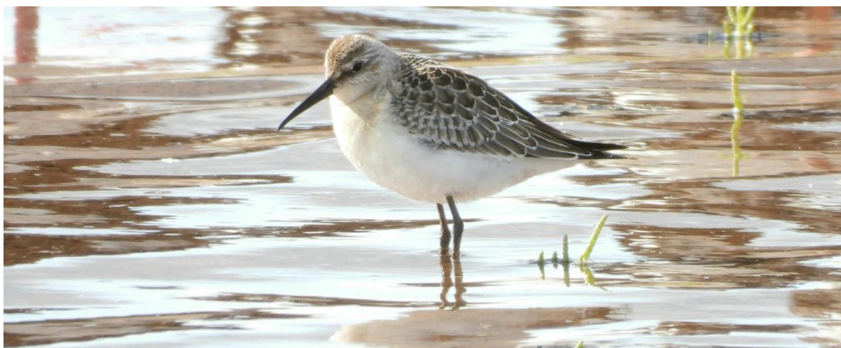
19 Aug

2021 records. A below average year, with just two records. The first was an early juvenile on 12 Aug which remained until the 19 th . A second juvenile was present intermittently 5-21 Sep.