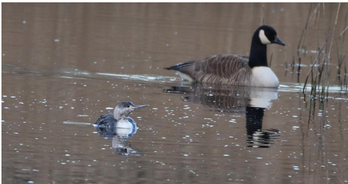
19 Apr

Status. Uncommon in winter and spring, scarce at other times