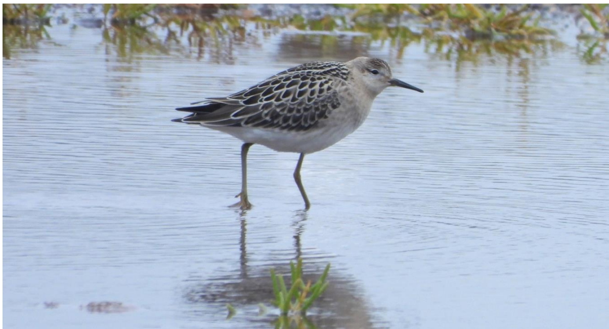
9 Sep

Status. Uncommon, rarely common in autumn, scarce in spring, rare in winter