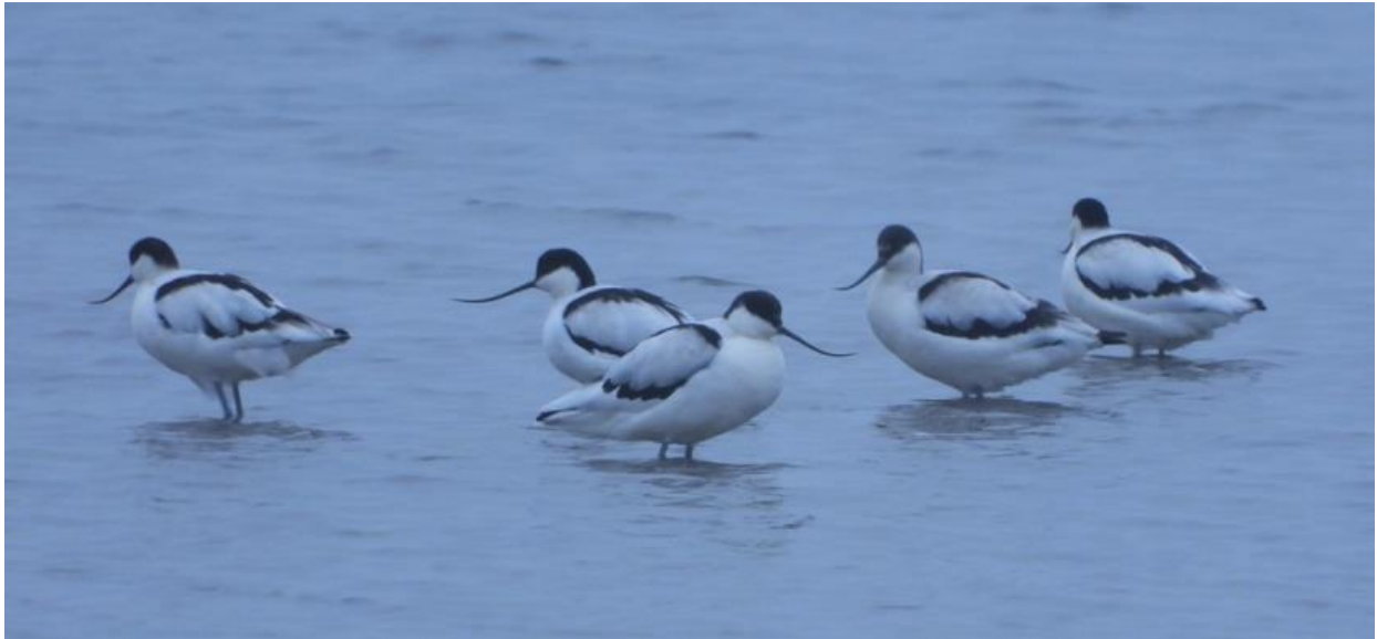
5 Sep

2021 records. Cold weather in Feb saw one on the 11 th with three the next day, two on 14 th and one until the 18 th . In autumn a flock of 11 were present on 5 Sep. The only late winter record was an injured bird on 3-5 Dec.