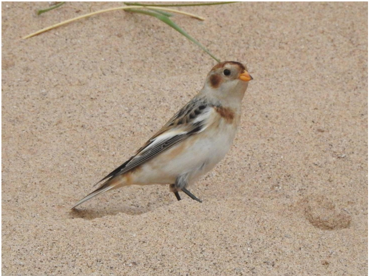
9 Nov

2021 record. A first winter female intermittently along the beach on 9-13 Nov.