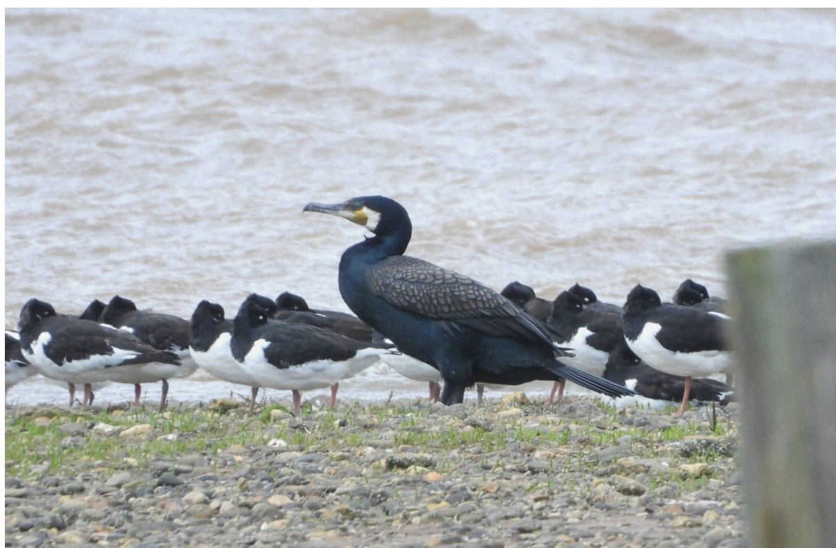
21 May

2021 records. Singles on 12 Feb, 21 May, 31 Oct and 23 Dec with two on 6 Nov.