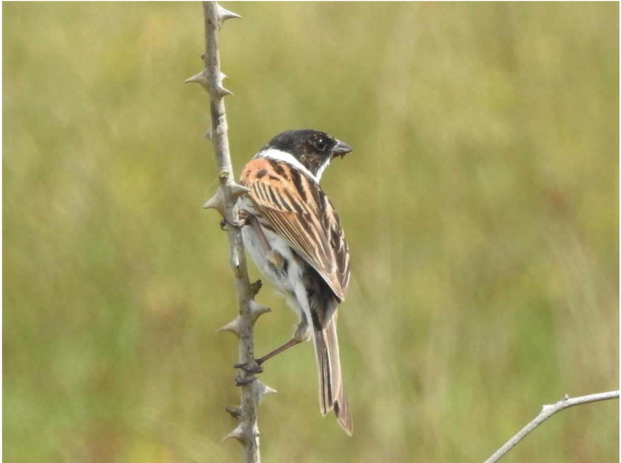
3 Jun © Alan Keatley