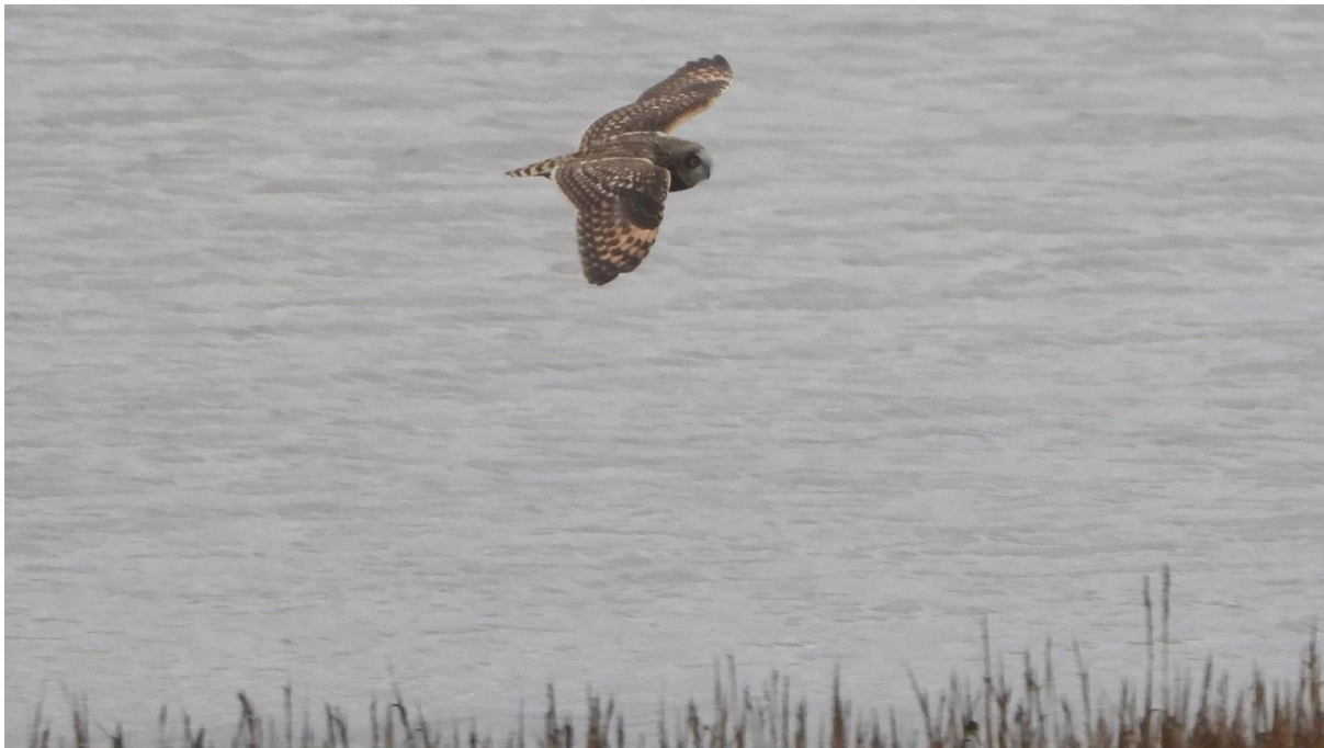
27 Oct

2021 records. Singles in the saltmarsh on 27 Oct, on Warren Point on 30 Oct and S offshore on 27 Nov.