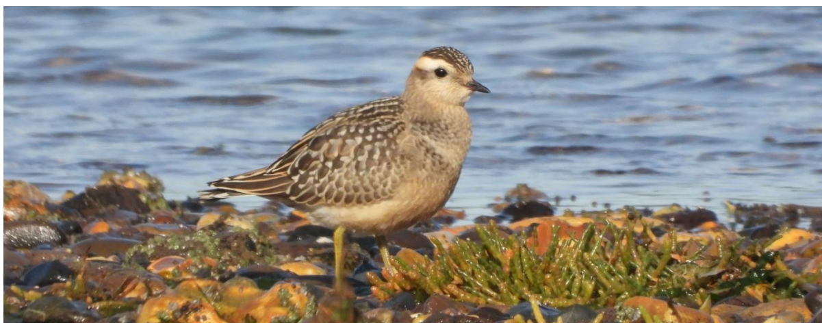
21 Sep

The last Warren record was seen briefly on 10 Sep 1961 and before that one in Jun 1867 with three other undated Victorian records.