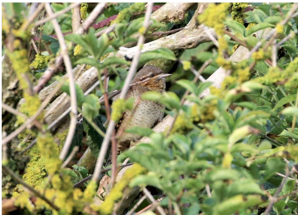
10 Sep

2021 records. A good year with five records, one on 24 Aug, 7-11 Sep, an elusive bird around the Bight and Golf Course, one on 19 Sep, 25 Sep on Warren Point, and the last of the year by the Main Pond on 16 Oct.