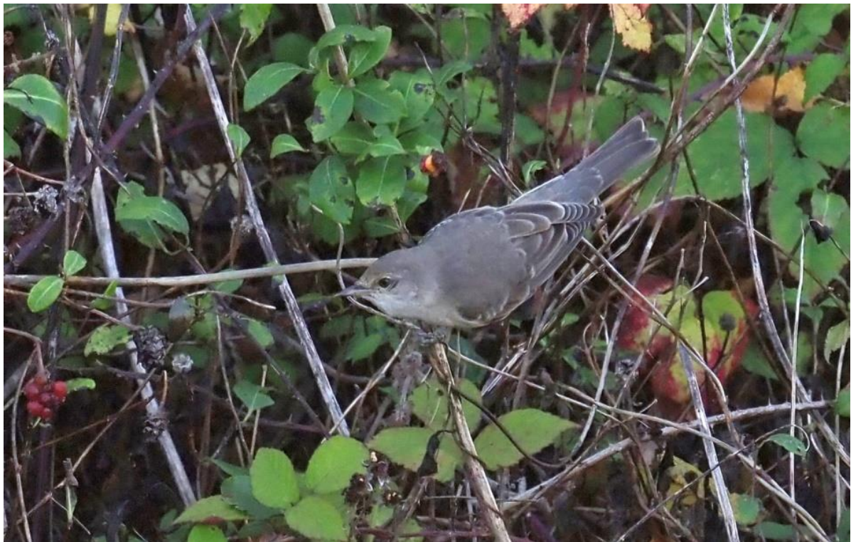
31 Oct

2021 record. One was around the east end of the Buffer Zone on 30-31 Oct. The 8 th site record.