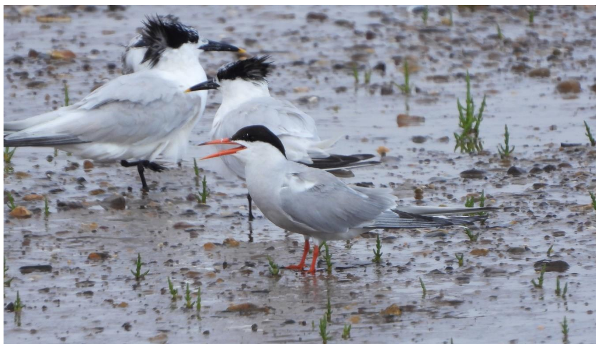
11 Jul

Status. Scarce in spring and late summer, rare in autumn