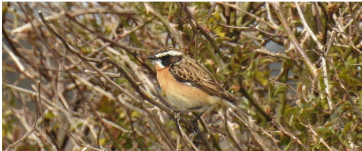
29 Apr

Autumn. Three singles on 26 Aug, 12 Sep and 9 Oct.